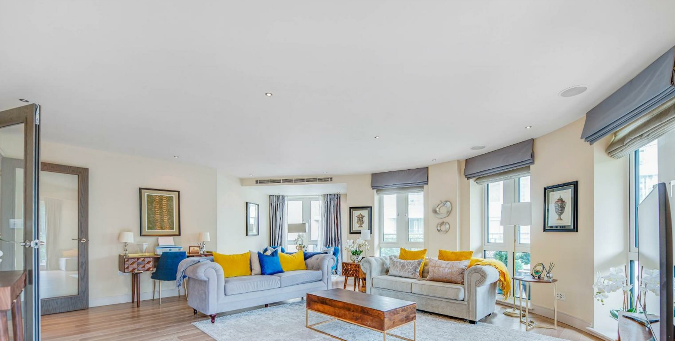
Doulton House, Chelsea Creek Fulham SW6